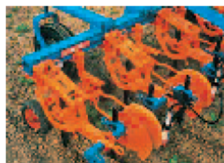
Hoe with band sprayer

* Percentages in comparison with full-area treatment